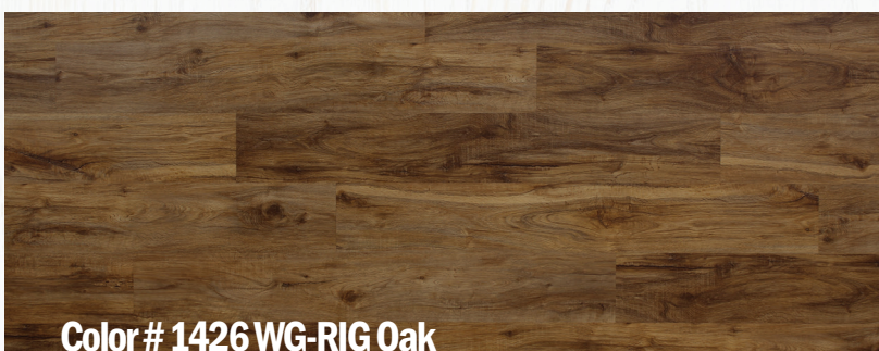
Color # 1426 WG-RIG Oak