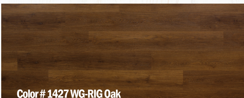
Color # 1427 WG-RIG Oak