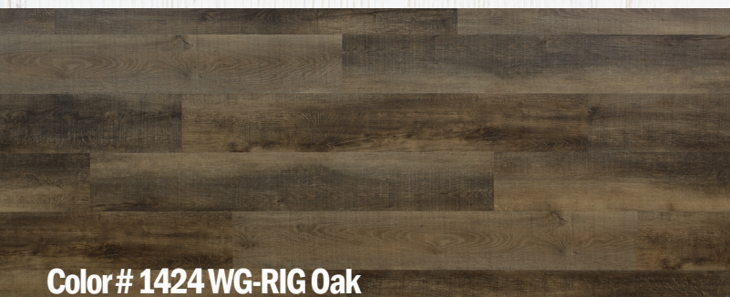
Color # 1424 WG-RIG Oak