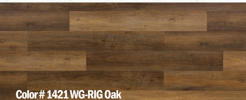
Color # 1421 WG-RIG Oak