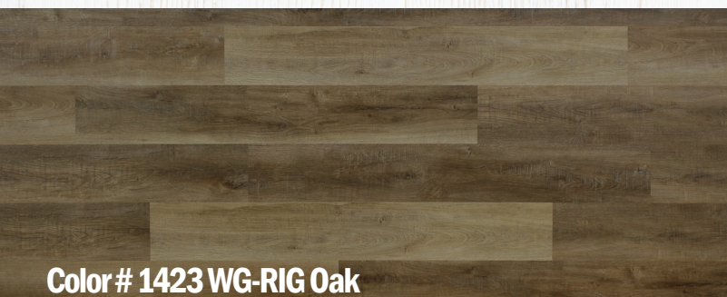
Color # 1423 WG-RIG Oak