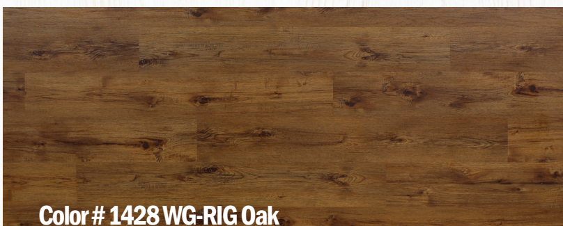
Color # 1428 WG-RIG Oak