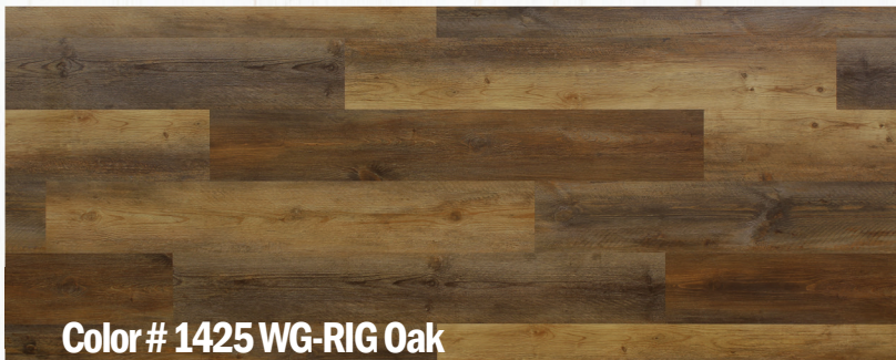
Color # 1425 WG-RIG Oak