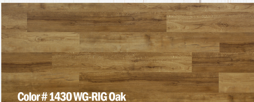
Color # 1430 WG-RIG Oak