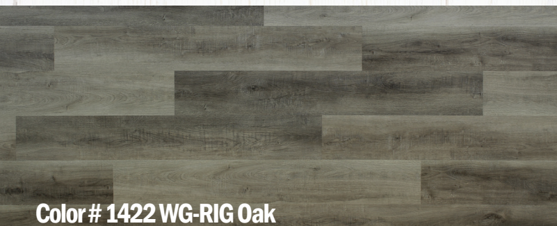
Color # 1422 WG-RIG Oak