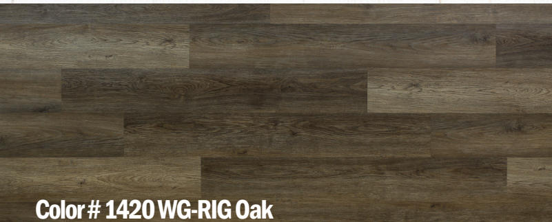
Color # 1420 WG-RIG Oak