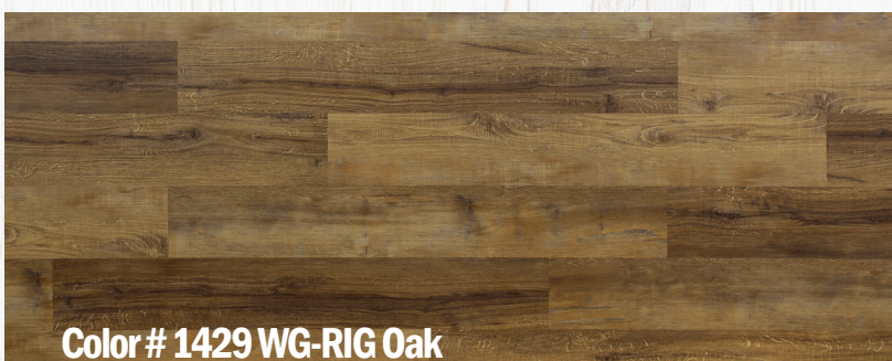
Color # 1429 WG-RIG Oak