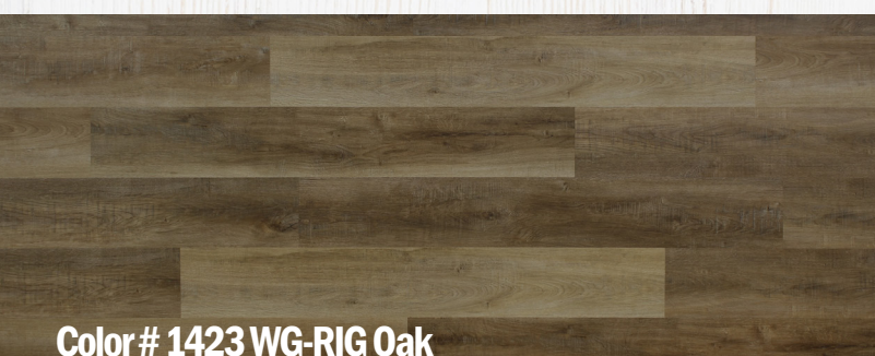
Color # 1423 WG-RIG Oak