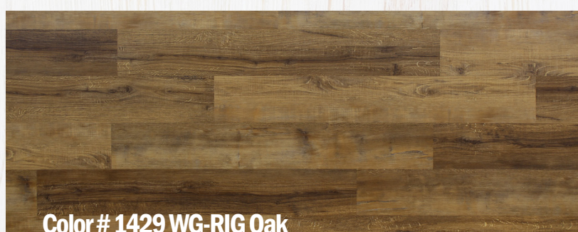
Color # 1429 WG-RIG Oak