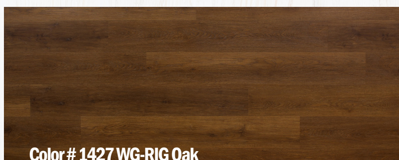
Color # 1427 WG-RIG Oak