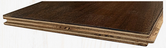
Color # 610 WB-E Oak